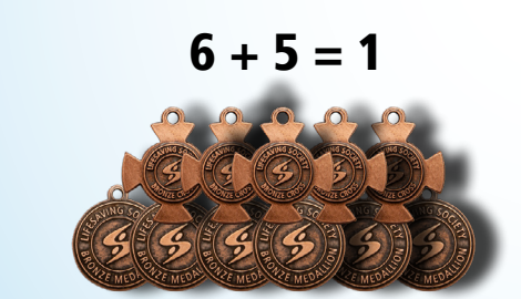
On average, it takes 6 Bronze Medallion and 5 Bronze Cross candidates to produce 1 new Swim Instructor.

Visit our website for more information on running Bronze Medallion and Bronze Cross courses.